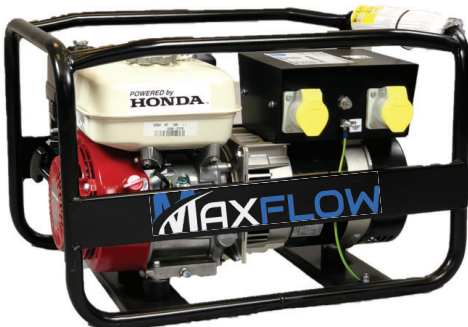
Model - STD27HF